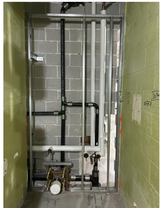
Plumbing rough-in and stud wall framing in restrooms on level 1.