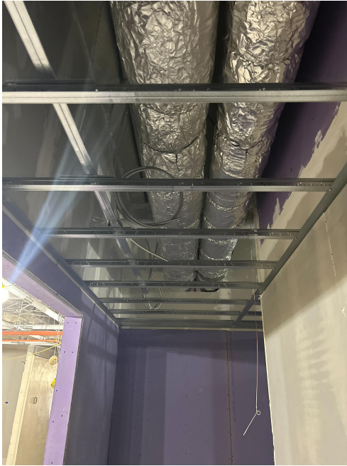
Framing ceilings on level 1.