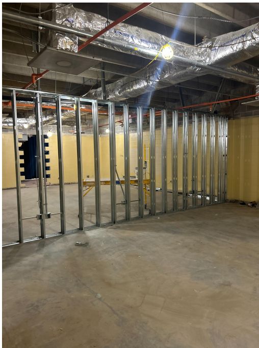
Stud wall framing in classrooms on level 1.