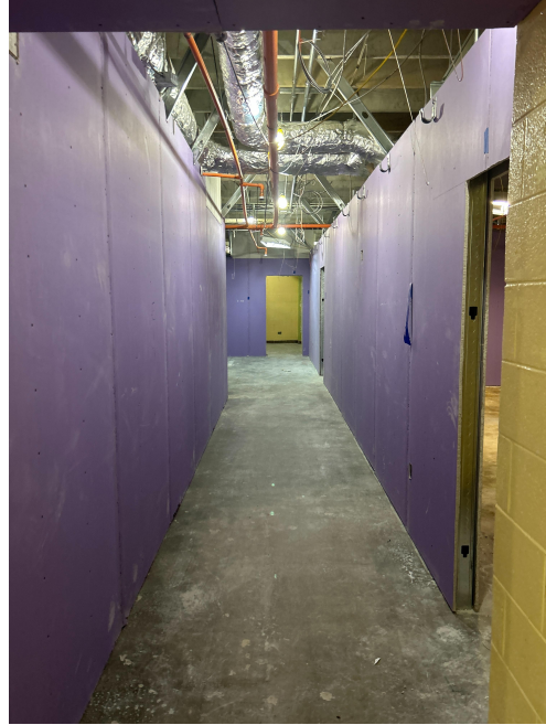
Dry wall installation in classrooms on level 2.